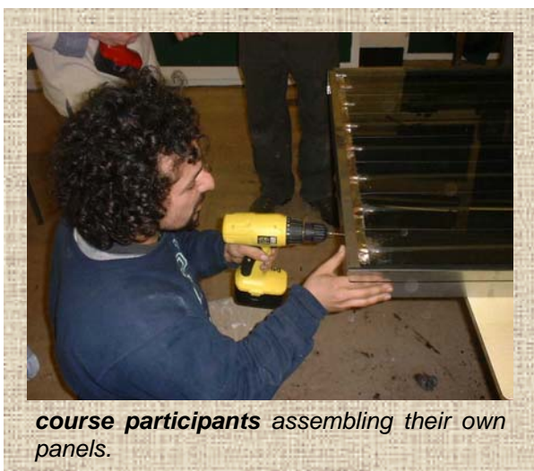
course participants assembling their own panels.

Contact us or visit our website to find out more about our factsheets, manuals & books, residential weekend courses, presentations and shop. You can also become a 'Friend of LILI', and receive our biannual newsletter, discounts on our courses, and help us to make a difference.